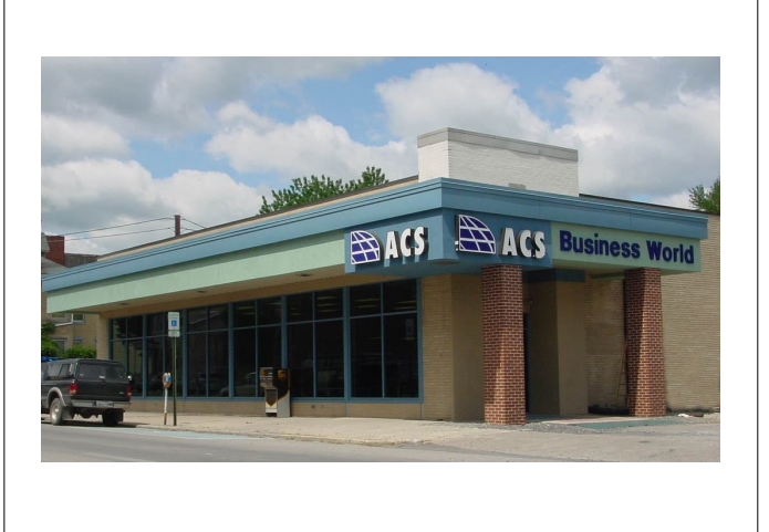
Newly expanded and renovated location of ACS Business World hosts the Annual Meeting of Downtown Lewistown, Inc.

This past year, Downtown Lewistown, Inc. expanded the range and depth of services offered to business and property owners of the Downtown community. Specifically, marketing, business, and property development assistance has been accessed and is now available through the DLI office in cooperation and coordination with partners in the commercial and community sectors. The past year has been active with over 3/4 of a million dollars invested by the private sector and an equal amount earmarked by local and County governments in support of expansion and development in the Downtown area. The Downtown Lewistown, Inc. Design Challenge reimbursement grant leveraged a 5 to 1 ratio of private investment in the Down-